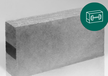
High Strength Grade