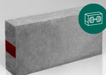
Super Strength Grade